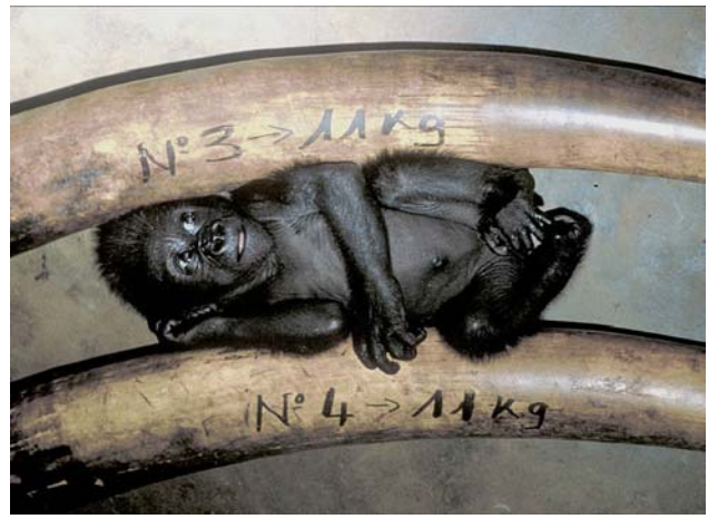
Cities and towns across tropical Africa have thriving markets where illegal bushmeat is sold at two to six times the price of chicken or beef. Orphan apes and elephant tusks represent a small but tragic commercial byproduct of the bushmeat trade.