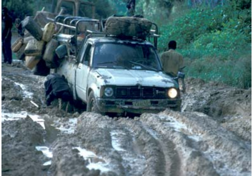
The road to the future in African rain forests is a dead end.