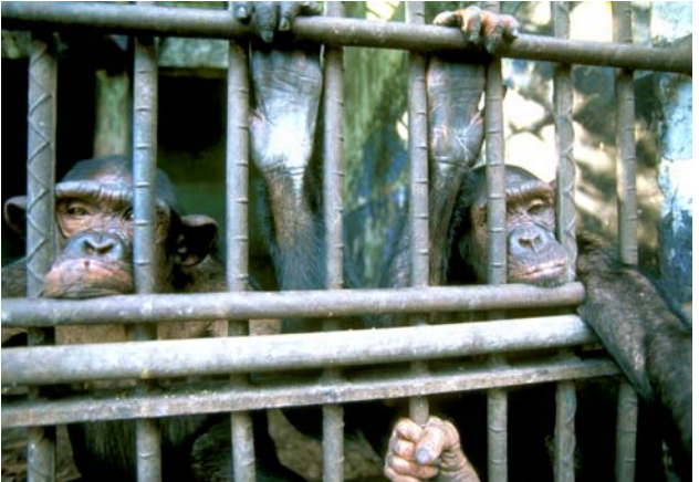
Most infant apes die within a month of their capture. Those that live typically become caged prisoners on starvation diets. None can return to the forests where they were born.